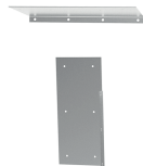
Side and top riser